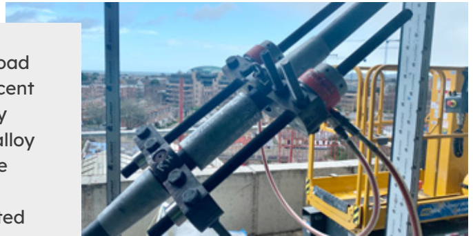
MACALLOY TECHNO TENSIONER UNIT used for stressing M90 Macalloy Tension Bars at a cantilevered corner in Dublin.

IPC HOUSE in DUBLIN is part of the Shelbourne road development for the Dublin business quarter adjacent to the Aviva Stadium. High capacity M90 Macalloy 520 bars were set to load and level using the Macalloy Techno Tensioner as prescribed by the client on the IPC house in Dublin. The Macalloy 520 bars were connected to the concrete structure using pin jointed articulated clevis units.